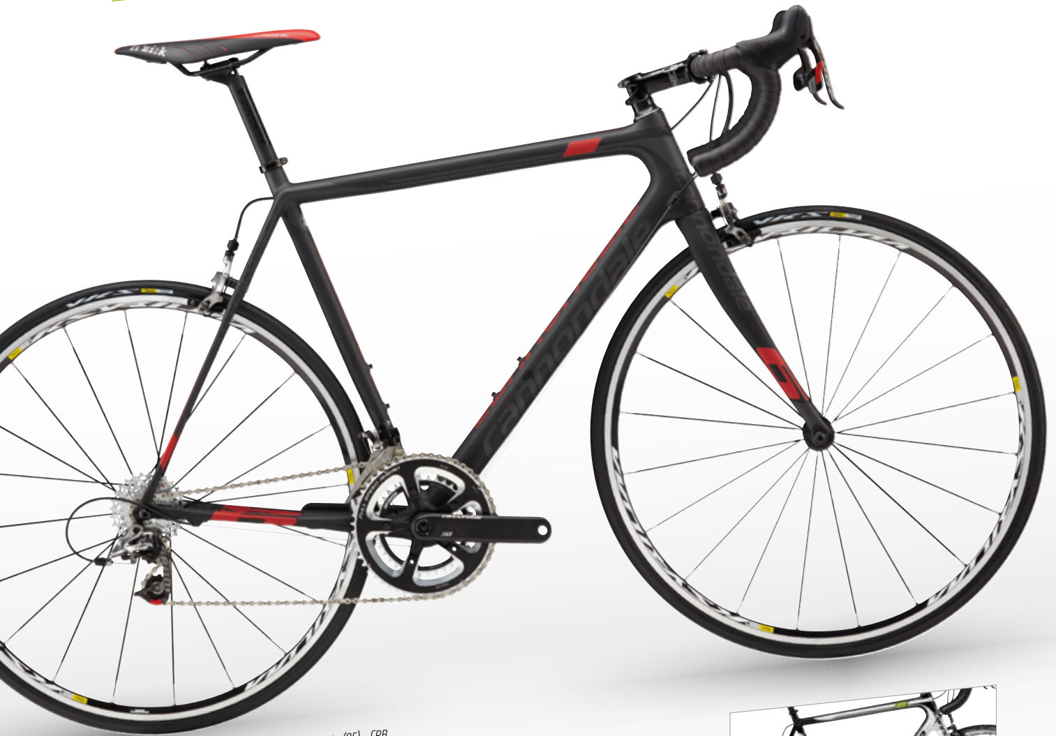
Jet Black w/Nearly Black, and Race Red, Matte (05) - CRB