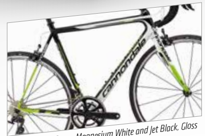
☞ Berserker Green, Magnesium White and Jet Black, Gloss (06) - REP