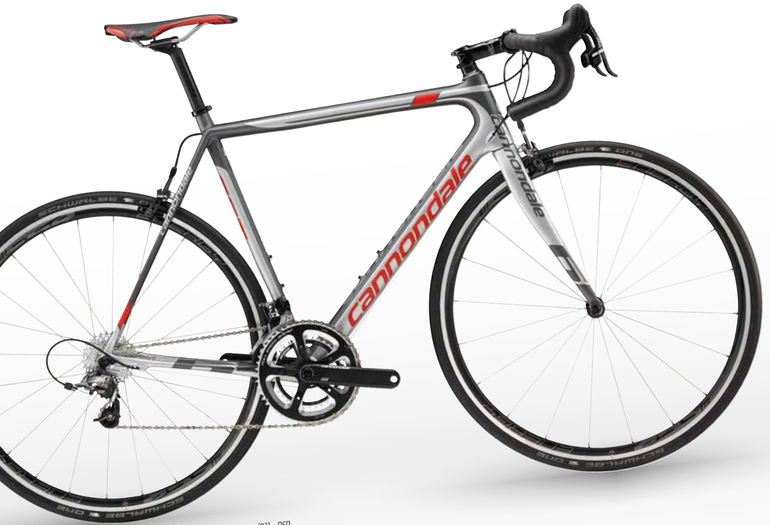
Charcoal Grey w/ Fine Silver, and Acid Red, Matte (03) - RED