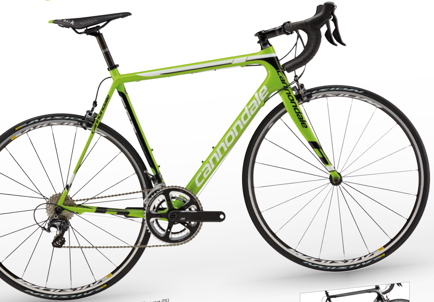
🏆 Berserker Green w/ Jet Black and Magnesium White accent (05)