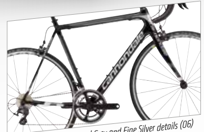
🏆 Jet Black, w/ Charcoal Grey and Fine Silver details (06)