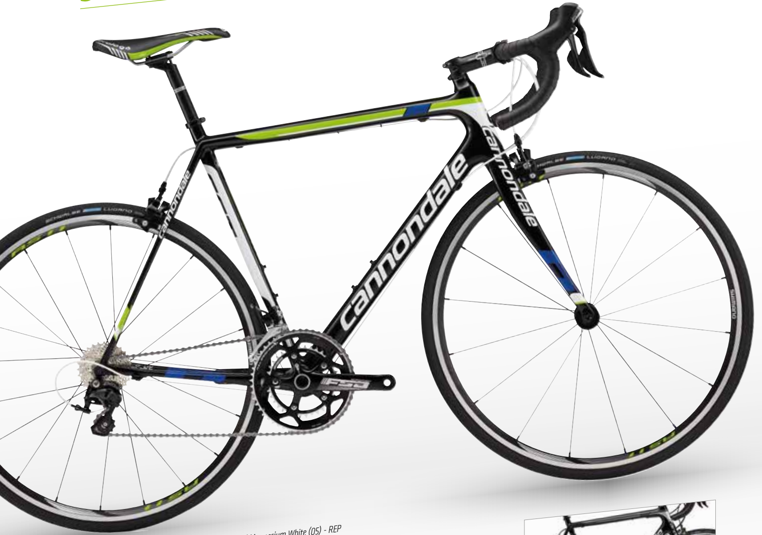
Jet Black w/ Nu Team Blue, Berserker Green and Magnesium White (05) - REP