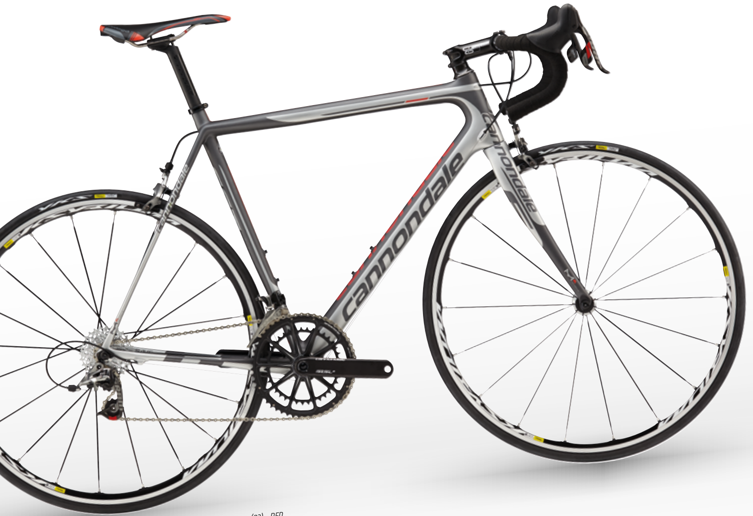
Charcoal Grey w/ Fine Silver and Acid Red, Matte (02) - RED