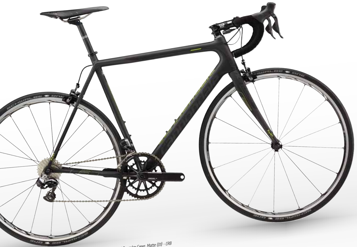
🔑 Exposed Unidirectional Carbon w/ Nearly Black and Berserker Green, Matte (01) - CRB