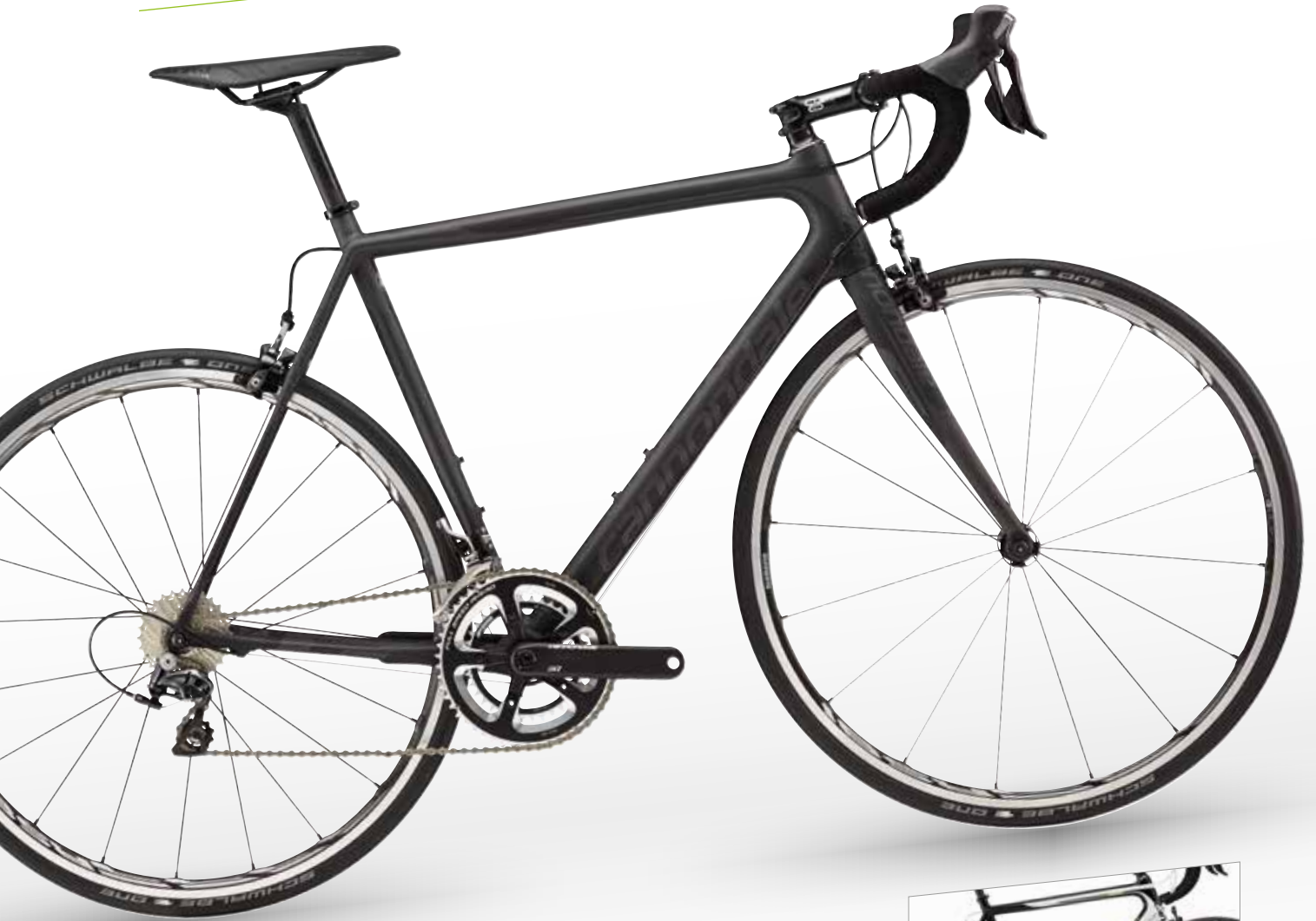
☞ Jet Black w/ Nearly Black, Matte (05) - BBQ