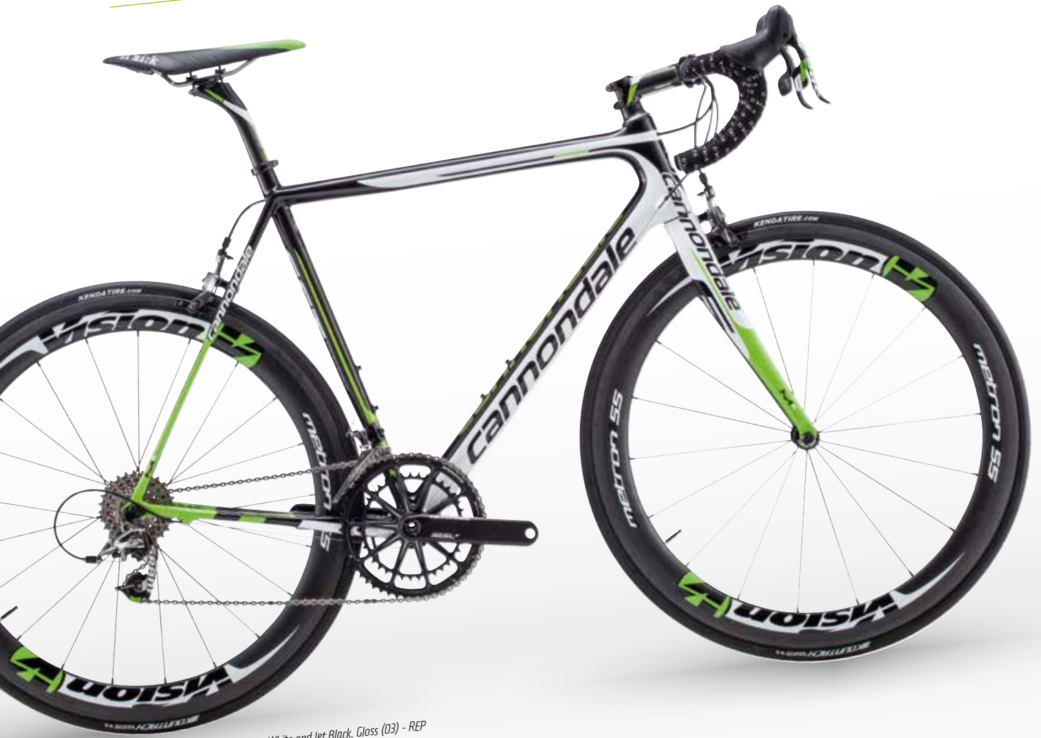
🔗 Berserker Green w/Magnesium White and Jet Black, Gloss (03) - REP