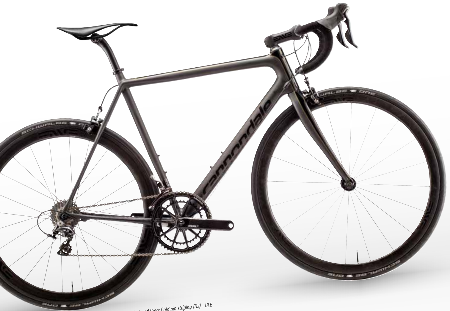
Exposed Matte Carbon w/ Gloss Geode Black and Brass Gold pin striping (02) - BLE