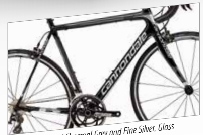
Jet Black, w/ Charcoal Grey and Fine Silver, Gloss (06) - BLK